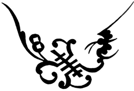
Longevity & prosperity